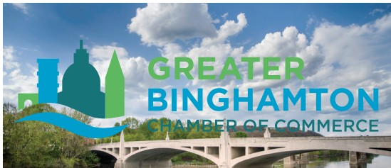
Do not place the logo on a busy background